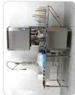
Against a wall

Thanks to the design with a hood, the machine can be placed just about anywhere in your kitchen, even in a corner or against a wall. Use both entry and exit tables to make the system as efficient as possible. This allows you to use two baskets with ease and wash up the contents of one while filling or emptying the other.