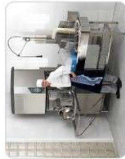
In a corner